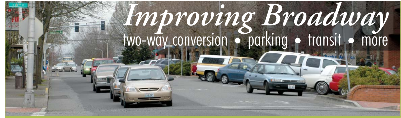
City of Vancouver, Washington