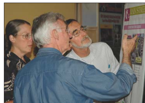
Information sharing at the first project Open House on June 6

The project's first open house on June 6 provided an opportunity for the