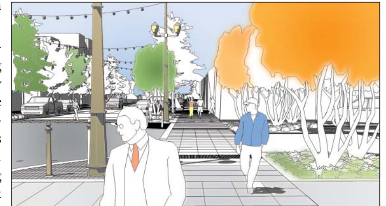
New streetscape elements, vibrant landscaping, and a pedestrian-friendly design will transform Main Street and continue the economic resurgence of downtown Vancouver.