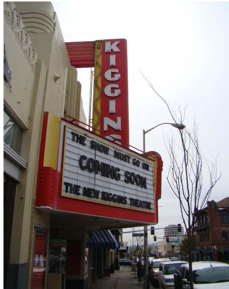
Kiggins Theatre, Vancouver, 1936