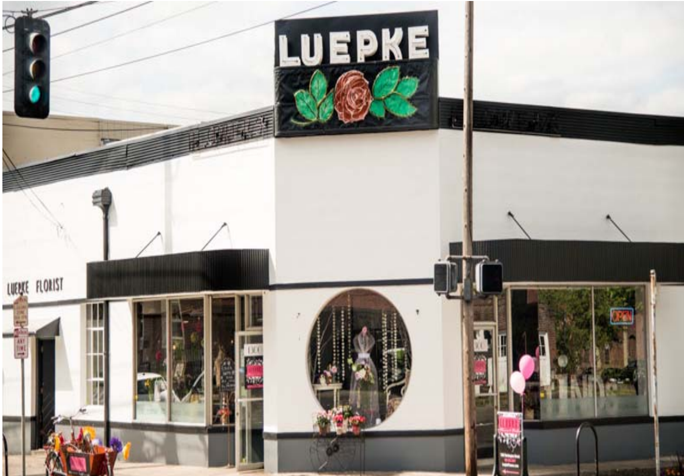
Luepke Florist 2016 Special Valuation