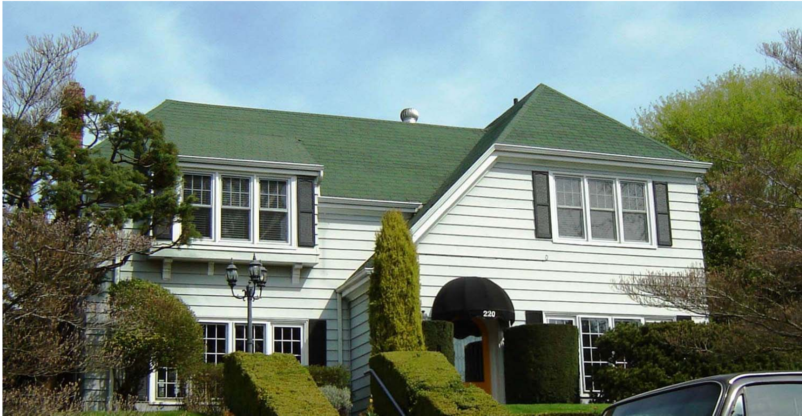
Clark County Heritage Register