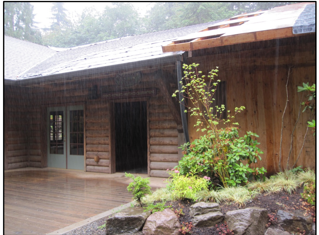
Summit Grove Lodge, Design Review, 2011