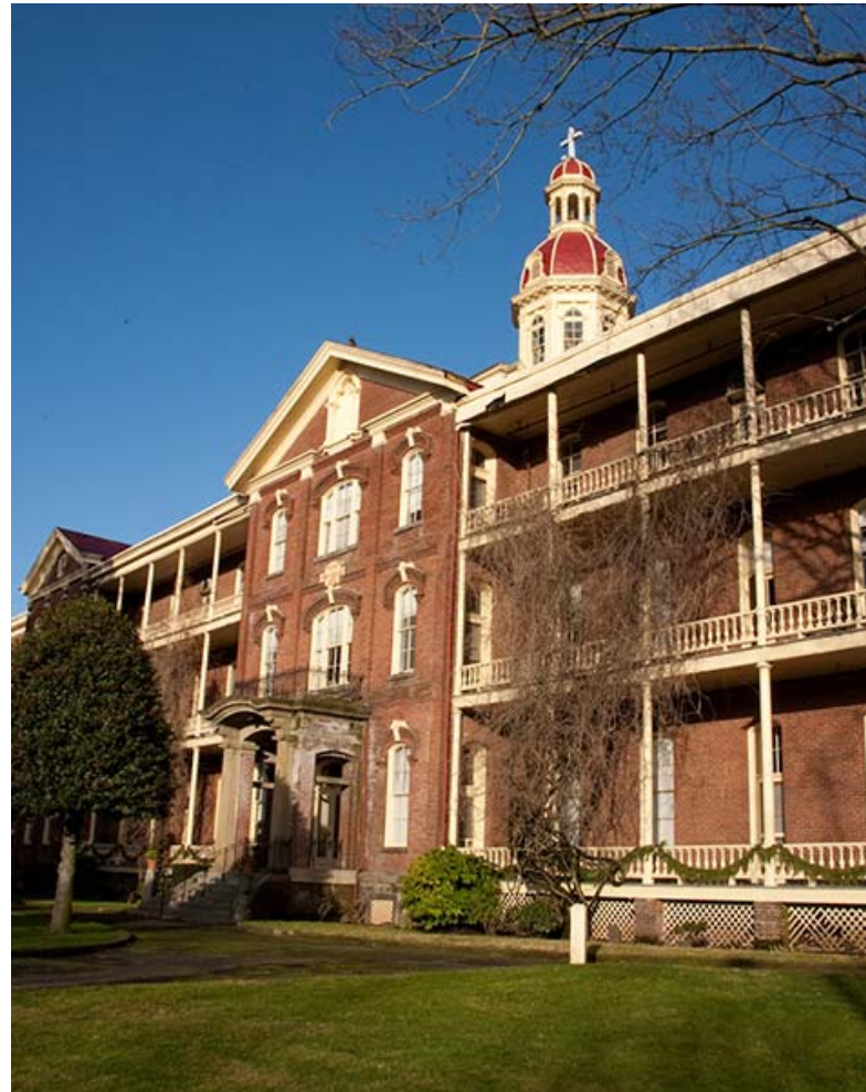
House of Providence, 1873