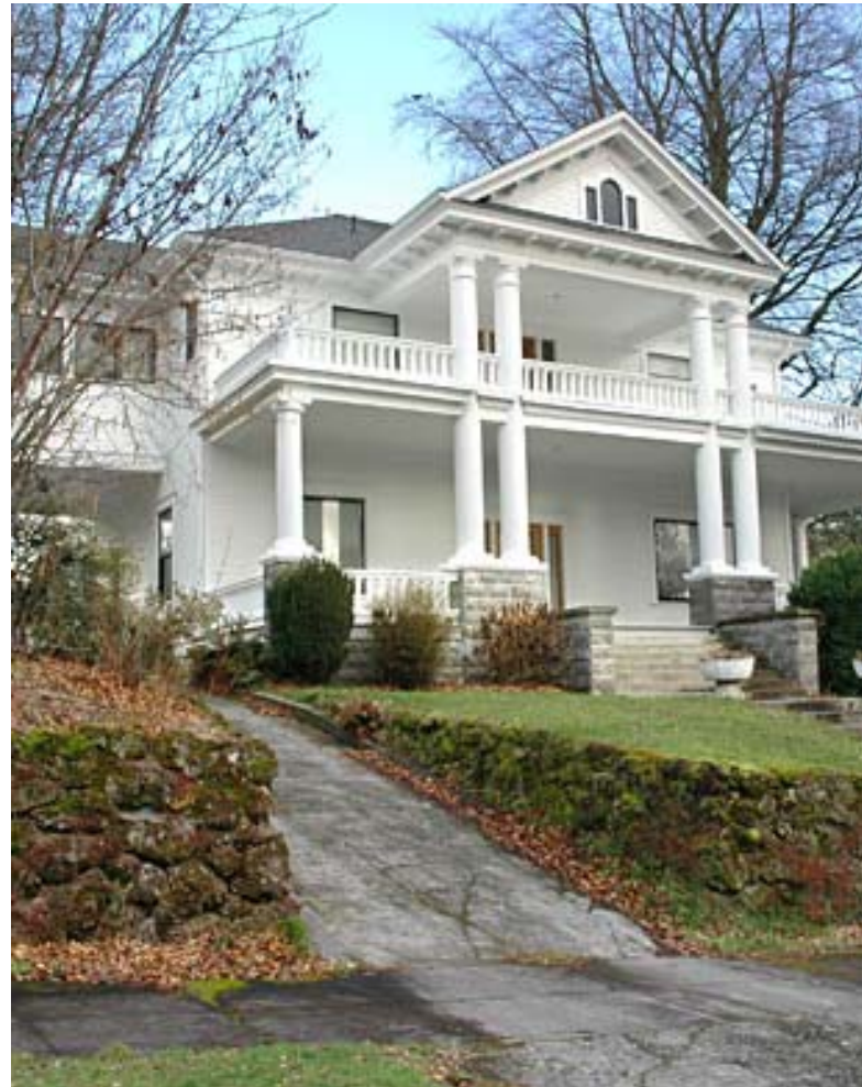
Farrell House, Camas, 1915