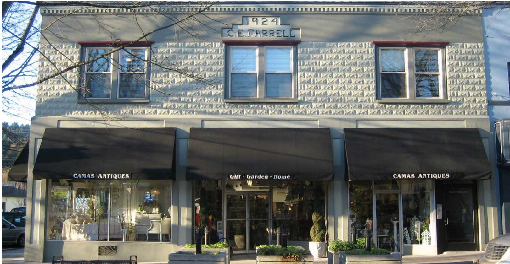
Clark County Heritage Register, National Register of Historic Places, Washington Heritage Register Farrell Building, Camas, 1924