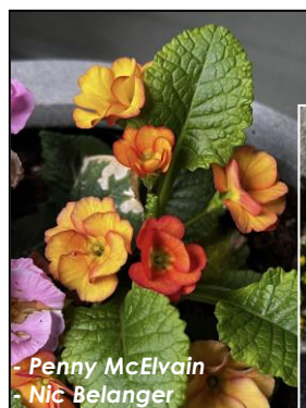
- Penny McElvain - Nic Belanger