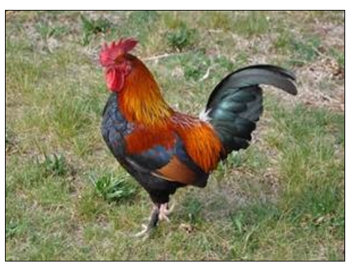
NO roosters permitted