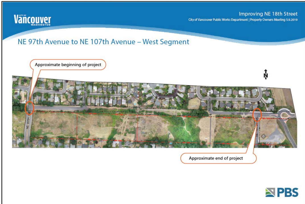
Display Board 1 – Aerial of West Segment