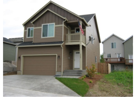
Housing Code Updates- 5