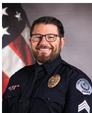
Sergeant Rick Lagerquist Meritorious Service Award