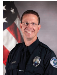
Ofc. Ken Suvada Meritorious Service Award