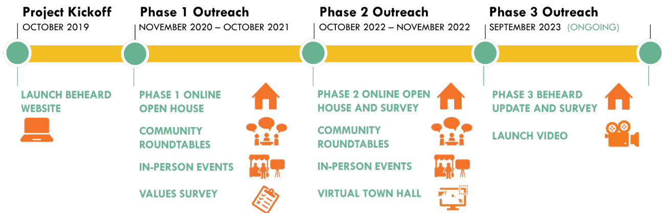
Figure 1. Community Engagement Timeline

Phase 3 activities took place throughout Fall 2023 and are currently ongoing to gather feedback on the Draft TSP and build public support for plan adoption. In addition to gathering wider public feedback online, the Draft TSP will go through formal review and public comment periods during the Vancouver Transportation and Mobility Commission and Vancouver City Council meetings in December 2023.