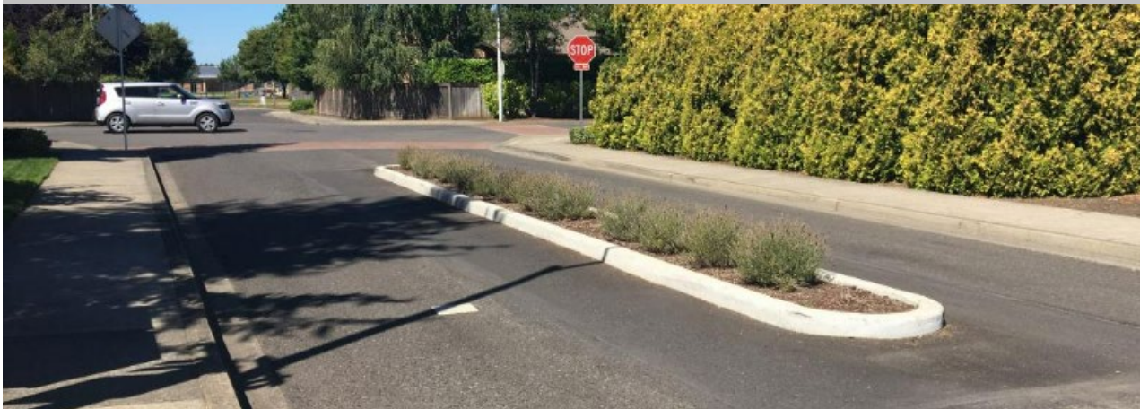
SE 195th and 15th