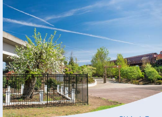
Old Apple Tree

The Heritage Tree Program was created by City Ordinance in 1997 (VMC Section 20.770.120) to protect and recognize our unique trees. The Urban Forestry Commission designates a tree as a Heritage Tree provided the tree meets the program criteria. To view the current Heritage Tree registry visit www.cityofvancouver.us/urbanforestry