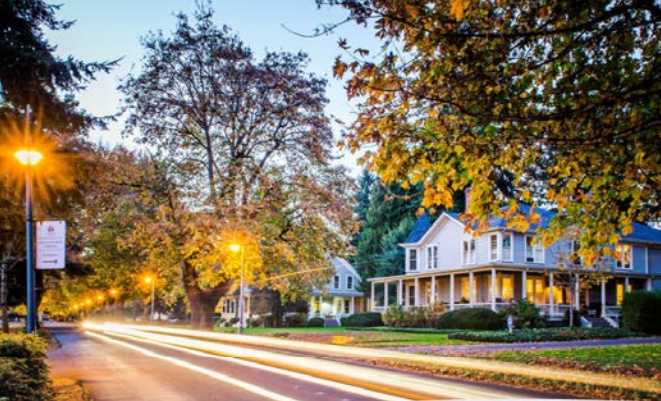
Officers Row grove