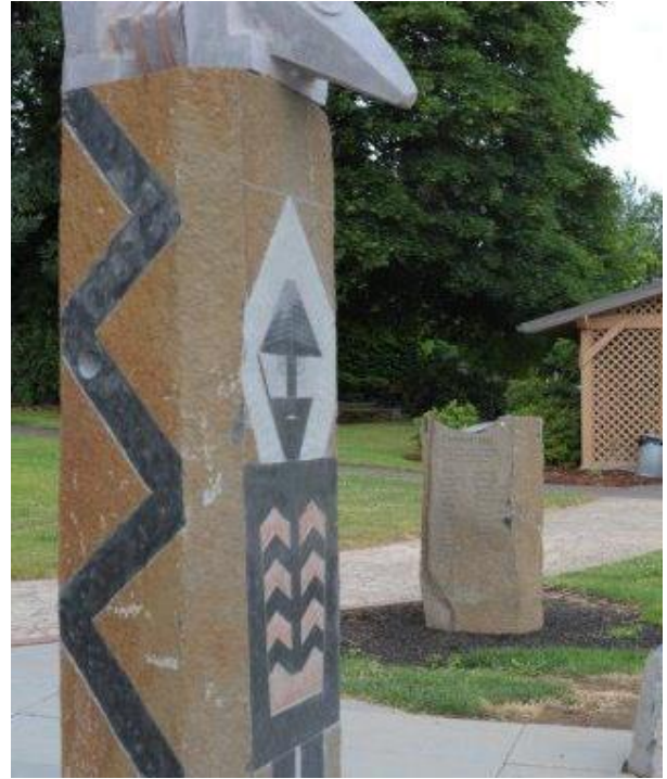
Parkersville Landing, Washougal, Circa 1845