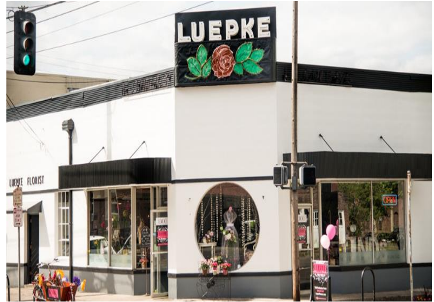
Luepke Florist, Vancouver, Built 1937

10-80 years of operation for a “green” building to recoup negative impacts of construction.