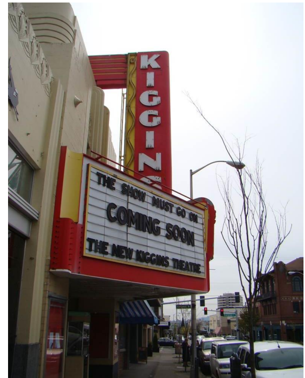
Kiggins Theatre, Vancouver, Built 1936