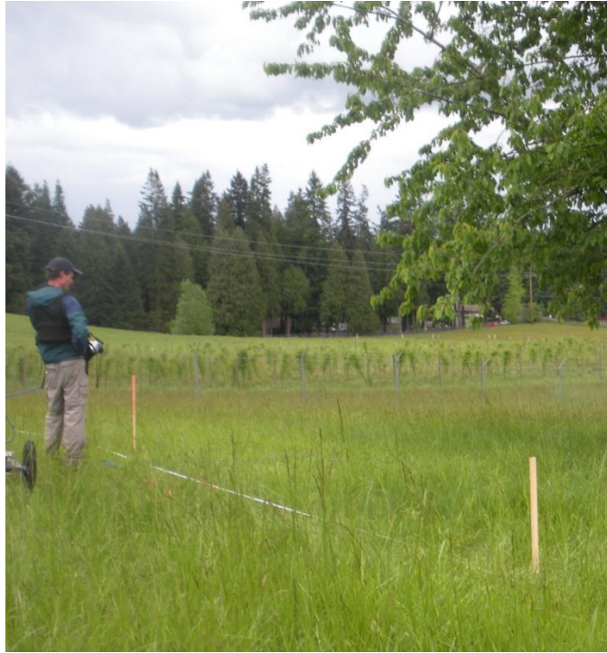
Clark County Poor Farm and Cemetery Documentation and Remote Sensing Report