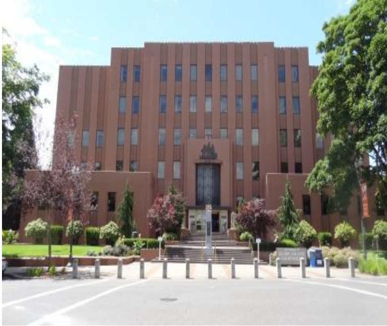
Clark County Courthouse, Built 1941