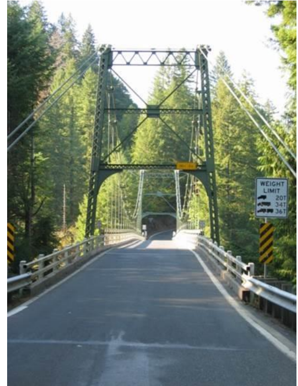
Yale Bridge, Battle Ground, Built 1932