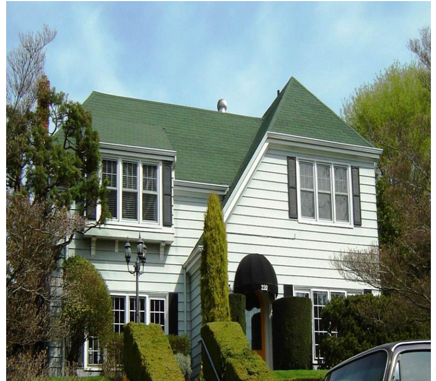
Propstra House, Vancouver, Built 1923