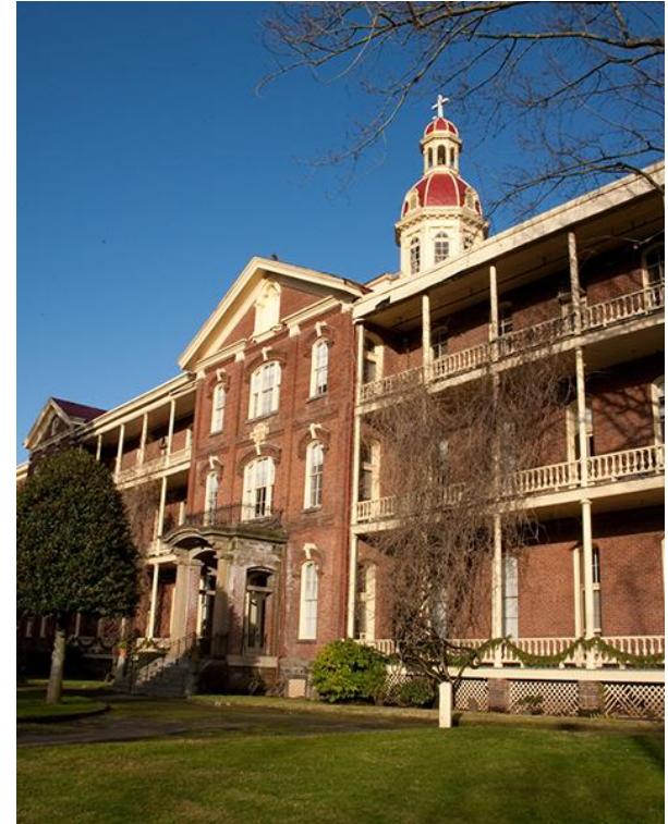
House of Providence, Built 1873