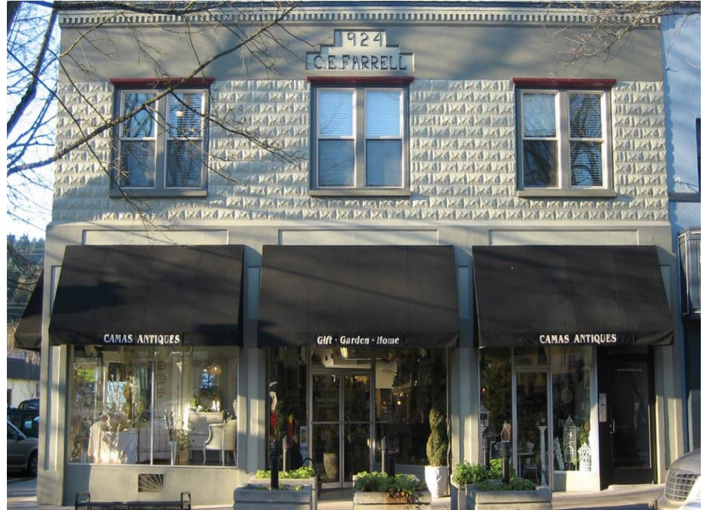
Farrell Building, Camas, Built 1924