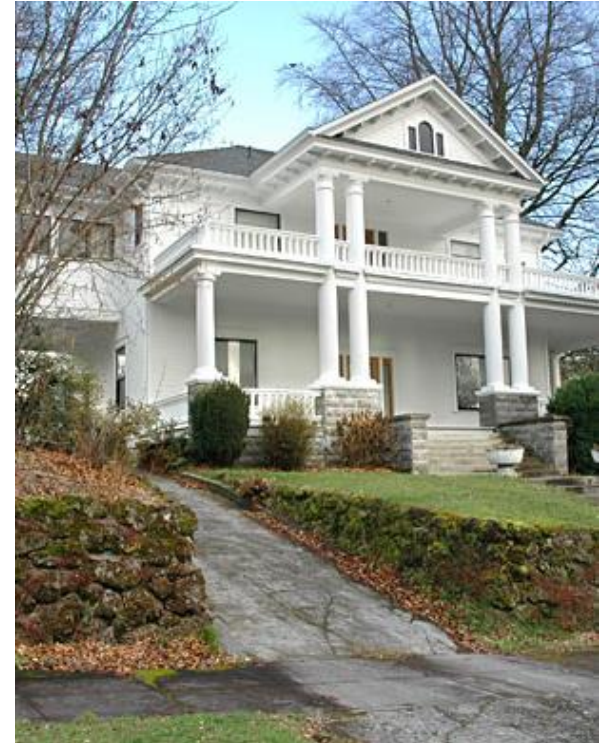
Farrell House, Camas, Built 1915