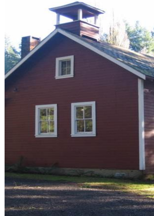
Venersborg School, Battle Ground, Built 1912