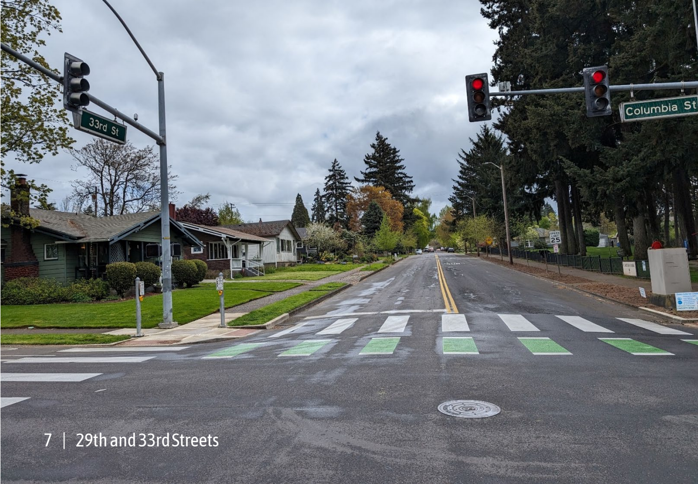
33 rd Street /Columbia Street