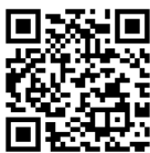
City of Vancouver (city meetings and events)

To find community events, scan the QR codes and check out these calendars.