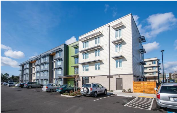
Isabella Court 2 – Built with HUD funding assistance