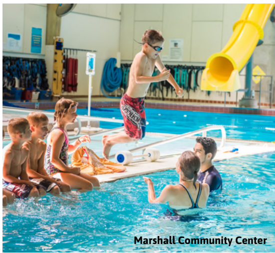
Marshall Community Center